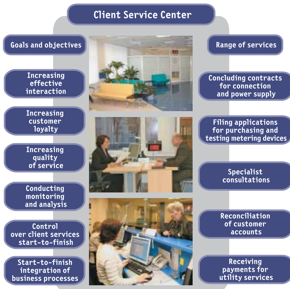
Belgorod Client Service Center

The leader in promoting advanced customer relations approaches is OAO “Central and North Caucasus Interregional Distribution Company”. Specifically, the first centralized client service system within the Holding Company has been created in the city of Belgorod.